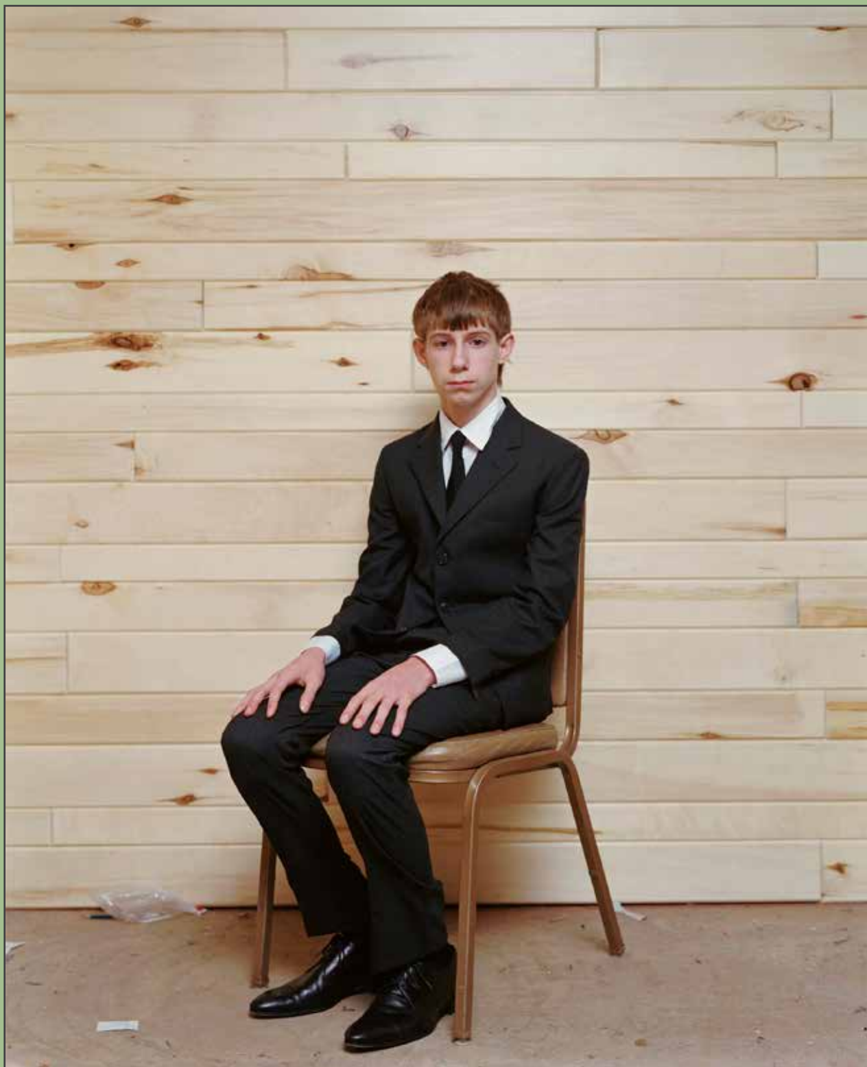
ALEC SOTH: PARIS / MINNESOTA