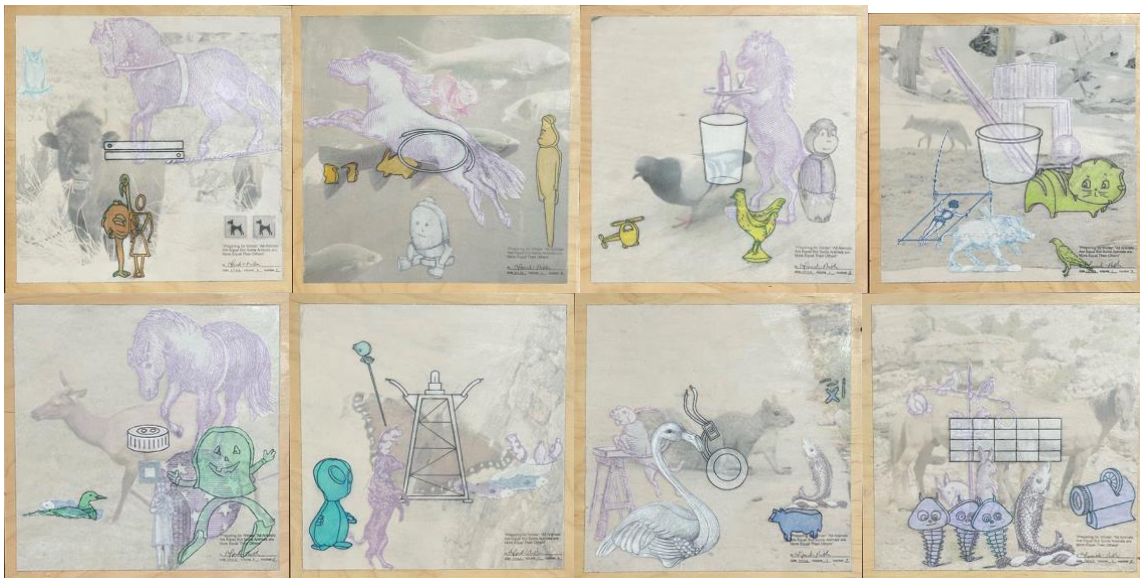
Preparing for Winter: "All Animals Are Equal But Some Animals Are More Equal Than Others." Series, 12" x 12" each, mixed media on wood panels.