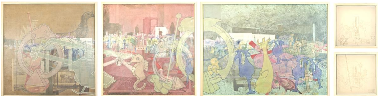
Free Water Project: "DO NOT FEED PIGEONS (CHICAGO MUNICIPAL CODE 728-710)" , One work in 5 sections. Acrylic paint, collage, graphite on paper, with layered nylon cloth mounted on wood, and graphite drawing on vellum, 34"h x 142" w in 5 sections.