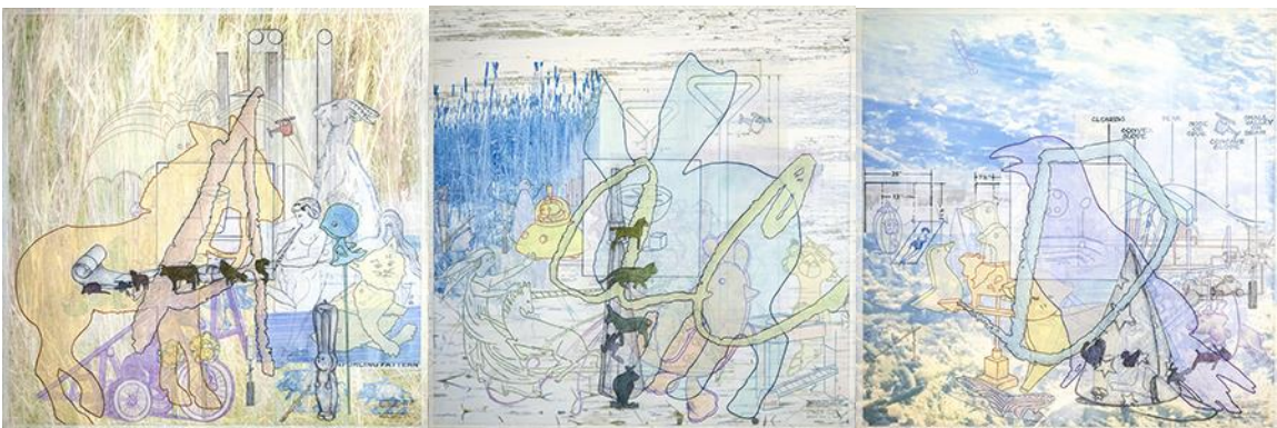
Preparing for Winter: Once again the animals were conscious of a vague uneasiness. 1.2.3., Series , mixed media on paper mounted on wood, 30"h x 30"w each.