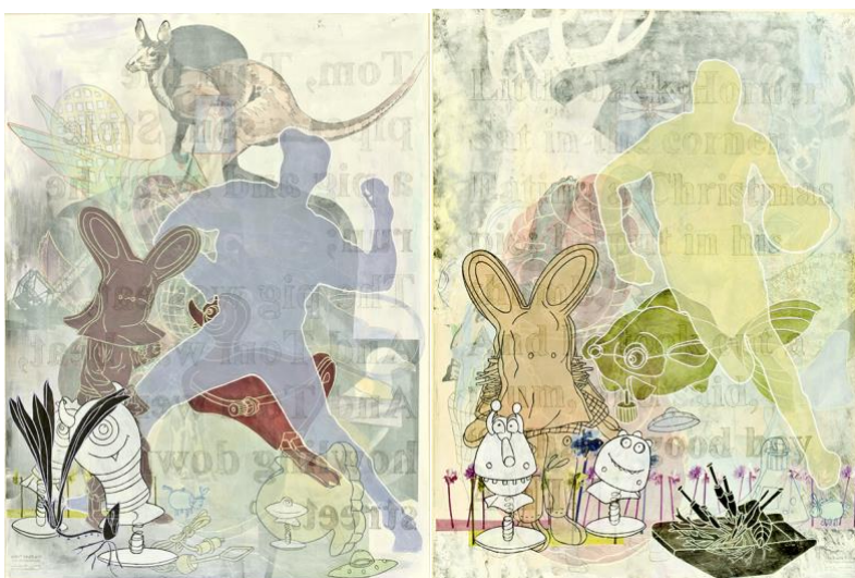
The Flush Toilet: This Planet is All Ours, 1 and 3. Series , acrylic paint, collage, graphite on paper, mounted on canvas 40" h x 30"w each.