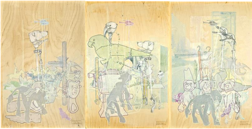
Looking for Alice: under the influence of ducks, 1: 1,2,3, Series. Acrylics, collage, and graphite on wood, 30"h x 20"w each.