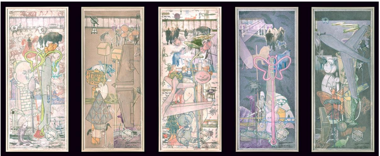
Preparing for Winter: "I will work harder. I,II, III, IV, V", Series, acrylic paint, collage, and graphite on fabric, 24"h x 11"w, each.