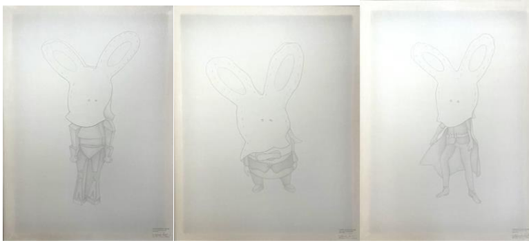
Preparing for Winter: Epilogue, the only constant is the becoming, 1, 2, 3. Series, 30" h x 22" (and 24" w), rabbit masked figure portraits, graphite drawing on stretched translucent paper.