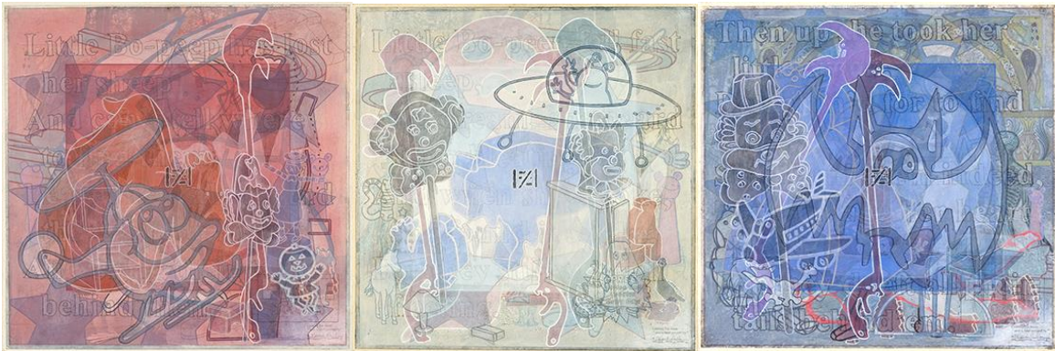
Looking for Alice: "and a bear passed by", 1:1.2.3, Series. acrylic paint, oils, and collage on weathered paper mounted on canvas. Each 22"h x 22"w.