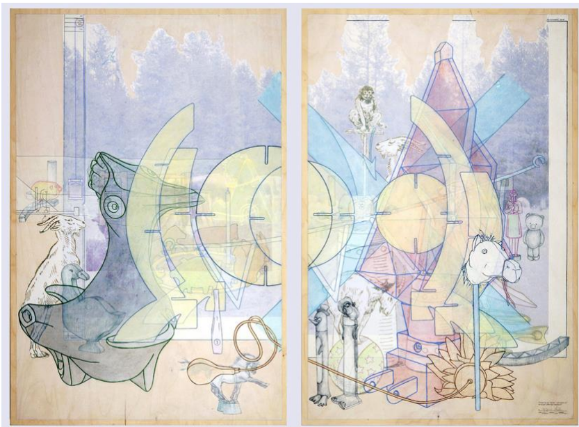
Preparing for Winter: will there still be sugar after the rebellion , One work-diptych, mixed media on wood panels, 36"h x 50"w,