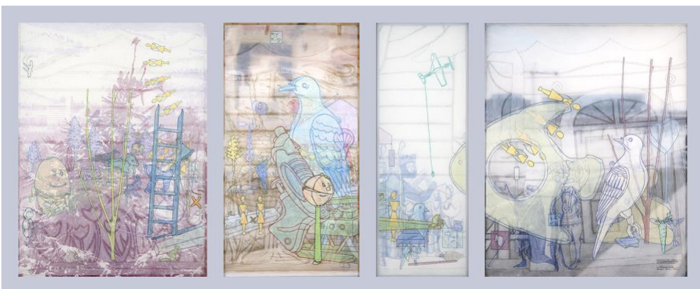
Preparing for Winter: If they could not defend themselves, they were bound to be conquered . 30"h x 77"w, One Work, mixed media on transparent plexiglass, in 4 sections.