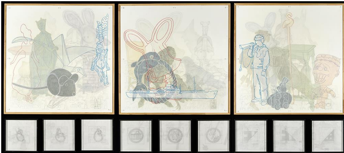
Looking for Alice: the rabbit hole, I, II, III, Series. Acrylic paint and graphite on plastic and graphite on vellum. In 4 sections per work, each- 56"h x 40"w.